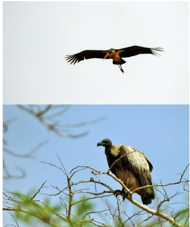
Marabou Stork & White-backed Vulture at CCC.