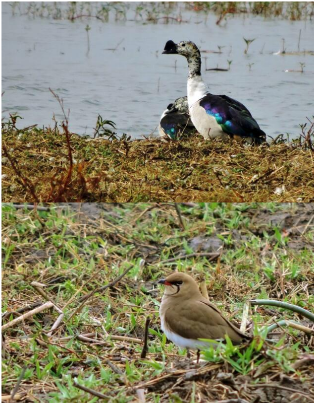
Comb Duck (top) & Collared Pratincole (bottom)

Yellow-throated Longclaws with other birders finding Secretarybird in the grasslands further from the dam. From the surrounding woodland we could hear the Emerald-Spotted Wood-doves and Cape Turtle-doves as well as the less familiar Magpie Shrike. Making our way onto the dam wall we could look down onto the next dam, where we were thrilled to find White-backed Ducks, Southern Pochards and the exquisite African Pygmy-goose. At the end of the dam wall and in the top dam, we caught a glimpse of an African Snipe as it flew into some dense reeds and weeds in the shallow water there. Our subsequent patience was rewarded with excellent views, this time of Greater Painted-snipe instead. With the sun setting, Collared Pratincoles hawked over the dam and several Yellow-billed Storks flew over looking for a roost as we returned to base camp.