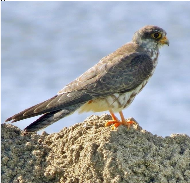
Amur Falcon at Hwange.