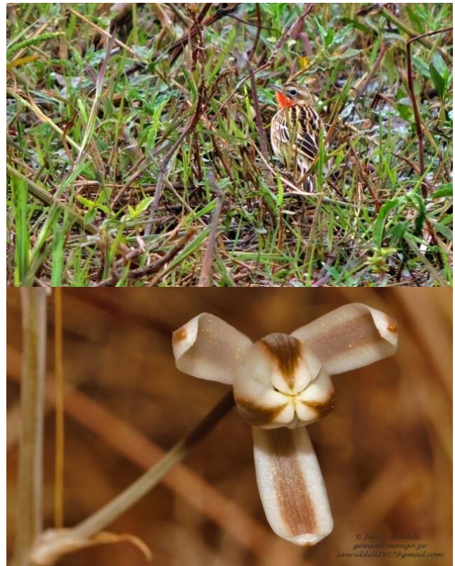
Rosy-throated Longclaw (top) & the snake lily Albuca kirkii (bottom), the latter quite common in the woodland

Miombo woodland west of the dam to seek out what birds we could. With the weather warming up many birds were singing lustily. Our list quickly grew, with additions including Ashy Flycatcher, Kurrichane Thrush, Green Wood-hoopoes, Black-headed Orioles and African Golden Orioles, Green-capped Eremomelas, Red-headed Weavers, Miombo Blue-eared Starlings, African Yellow White-eyes and Red-faced Cisticolas all making themselves heard early on. Walking along the base of the ridge we were delighted to hear Coqui Francolin in addition to the more common Natal Spurfowl and Swainson's Spurfowl. With time flying, we turned back and retraced our steps only to find Retz's Helmet-shrikes and White-crested Helmet-shrikes, Green-winged Pytilia, Cardinal Woodpecker, African Grey Hornbill, Black Cuckooshrike and Swallow-tailed Bee-eater as well as a disgruntled Barn Owl that we flushed from a large tree cavity.