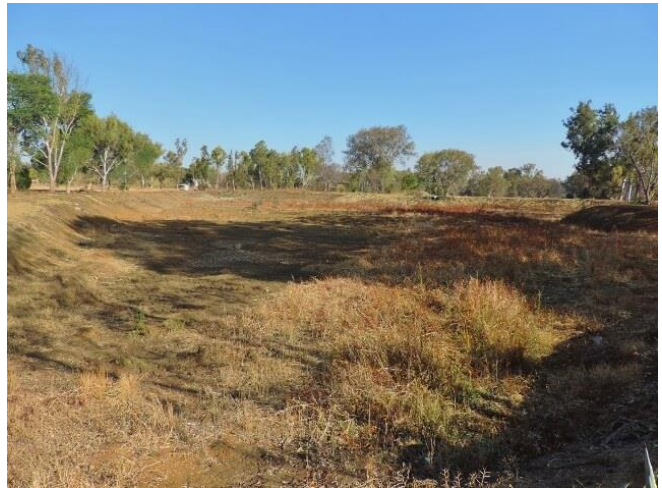
The main pond, now dry and devoid of the trees and Typha beds that previously provided a diverse habitat for a variety of waterbirds