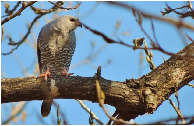
This Lizard Buzzard was very interested in some potential prey in the dry streambed below